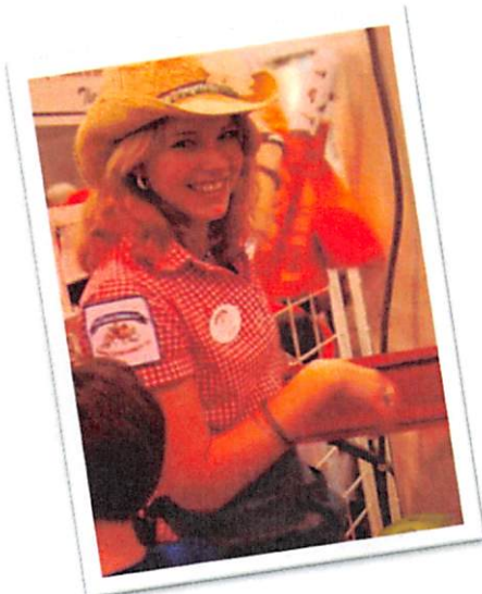
Exhibit Staffing - Staffing will be provided by Great American Entertainment Co. Staff members are friendly, courteous, and knowledgeable and wear nametags and colorful farm themed uniforms.