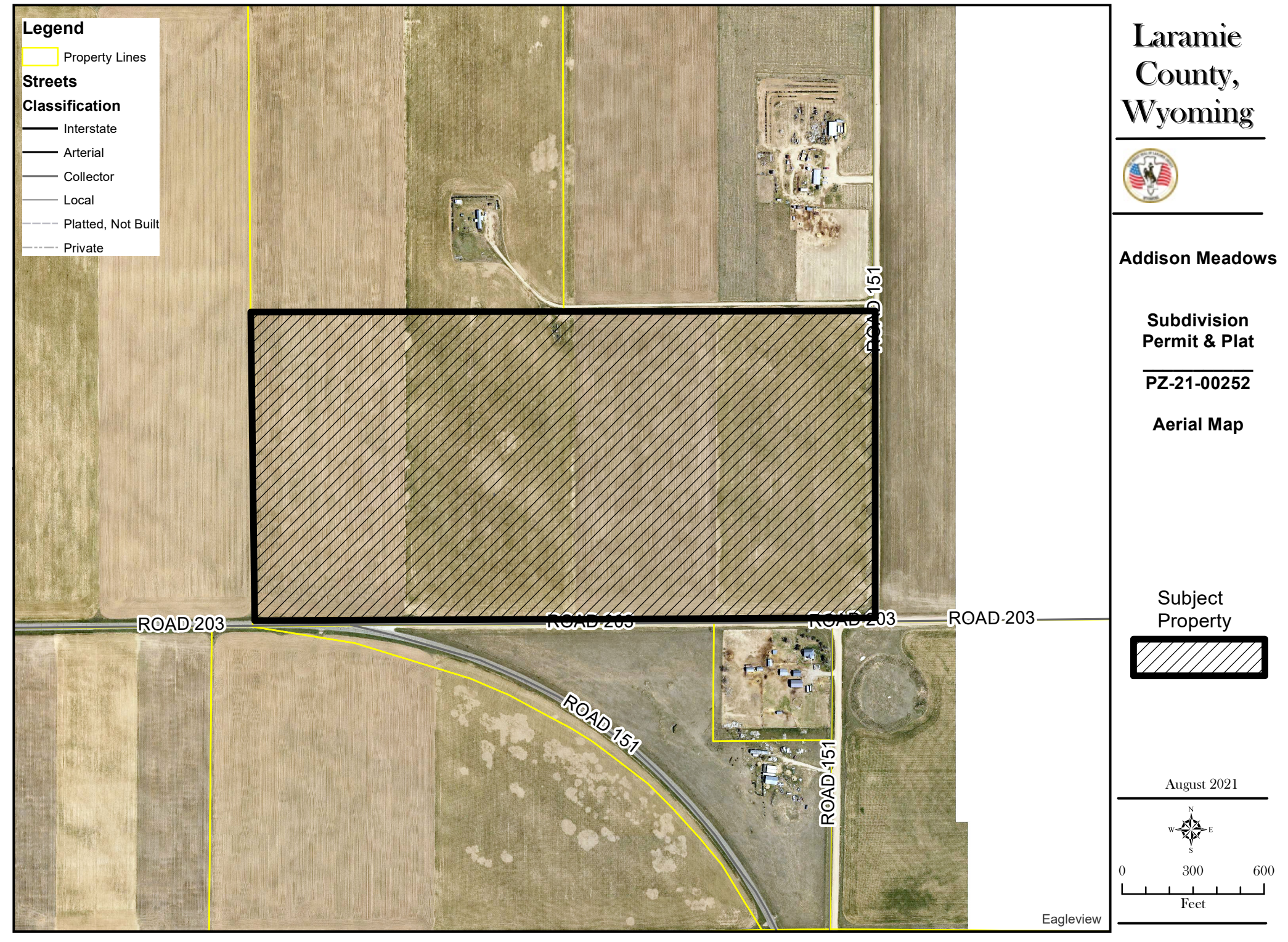
This map is made possible through the Cheyenne and Laramie County Cooperative GIS Program (CLCCGIS). The data contained herein was collected for its use and is for display and planning purposes only. The CLCCGIS will not be held liable as to the validity, correctness, accuracy, completeness, and/or reliability of the data. The CLCCGIS furthermore assumes no liability associated with the use or misuse of this information.