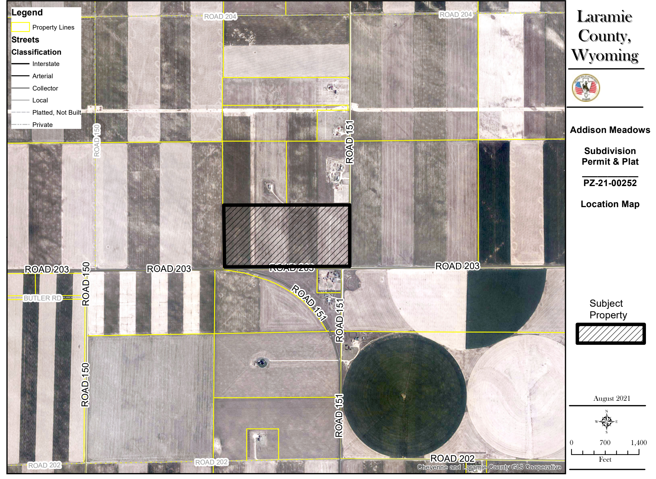
This map is made possible through the Cheyenne and Laramie County Cooperative GIS Program (CLCCGIS). The data contained herein was collected for its use and is for display and planning purposes only. The CLCCGIS will not be held liable as to the validity, correctness, accuracy, completeness, and/or reliability of the data. The CLCCGIS furthermore assumes no liability associated with the use or misuse of this information.